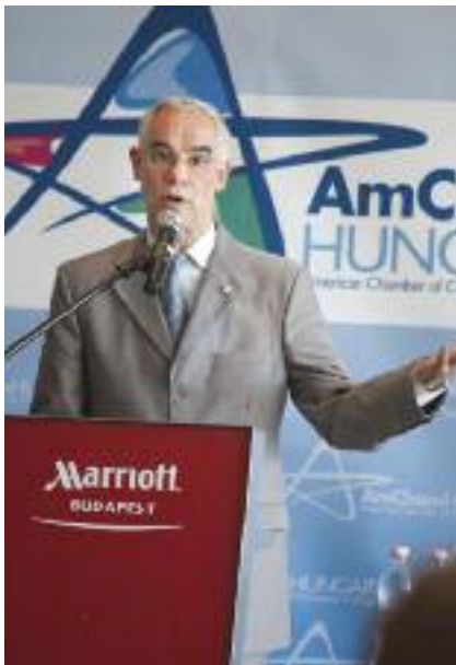
Minister Zoltán Balog

At our Business Forums, AmCham members were addressed by ministers and experts of the economy: Iryna Ivaschenko, Resident Representative in Hungary, International Monetary Fund; Árpád Kovács, President of the Fiscal Council, Zoltán Balog, Minister of Human Resources and György Matolcsy, Minister for National Economy.