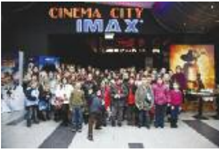
Charity Movie Morning