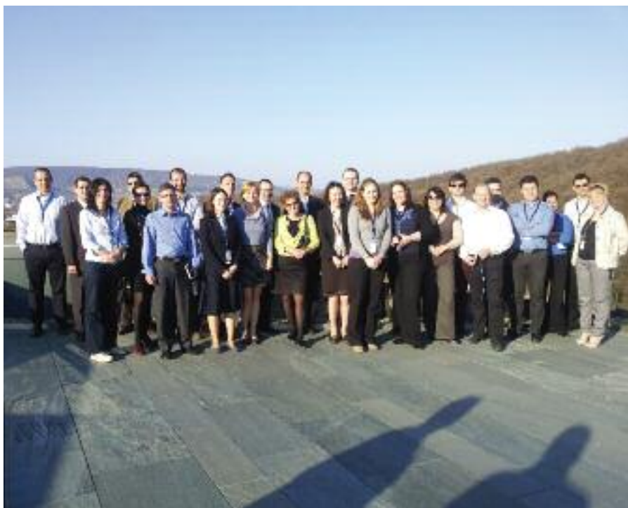
Committee meeting at Telenor

I would like to thank our members for their active contribution to the above goals and achievements of the committee. Special thanks to the hosts of this year's meetings: Telenor, Xerox, Ernst & Young and CEZ.