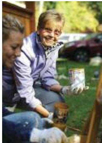
A Day to Make it Happen in Kismaros