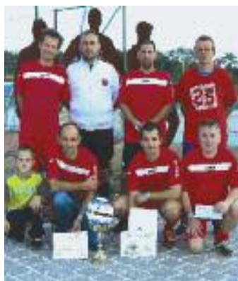
Fourth AmCham Family Sports Day