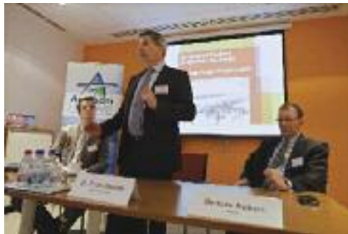
SME Seminar on HR hosted by PwC

The members of the SME Committee hope that through these seminars, the Committee will successfully give recommendations and suggestions to small companies on how to stay competitive, find cost-effective solutions and continue to play an important role in this continuously changing business environment.