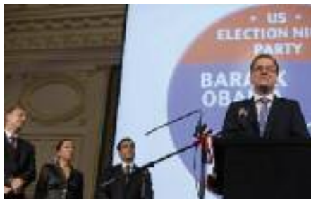
Deputy Prime Minister Tibor Navracscs greets guests at the US Election Night Party

More than 1,400 people attended the US Election Night Party on November 6th. Program highlights included authentic campaign materials, live introduction to the presidential candidates, live video feeds from major US news networks, mock election at the Oval Office, quiz show and music by the Hungarian Air Force Band.