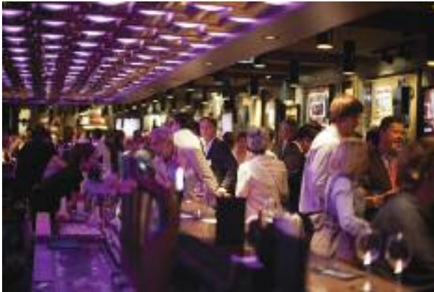
Business After Hours at the Hard Rock Café

As we close 2012, we are beginning to feel a sense of wanting to belong. Well-recognized companies have joined, which will certainly help our future membership-drive efforts.