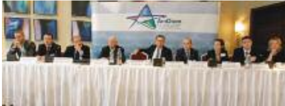
Board meeting simulation