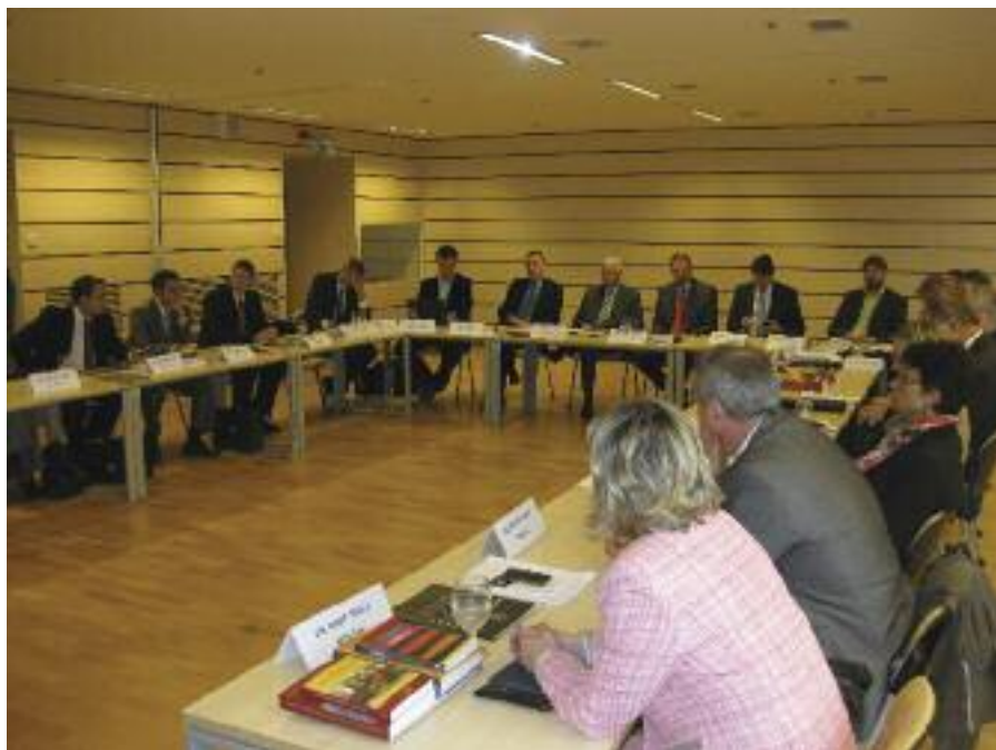
Education roundtable at the University of Pécs