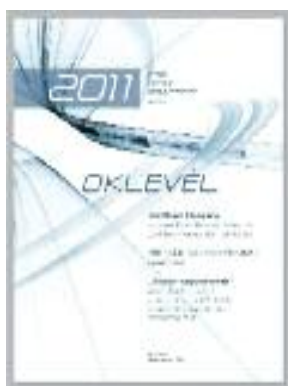
MPPSZ CSR Best Practice Award

The third project was the “Language Ambassadors” program. During the program, 32 schools were visited, 47 AmCham members delegated 101 language ambassadors, 160 lessons were covered and 2,900 students were reached. The most active members who delegated more than 10 ambassadors include, GE Hungary, GE Money Bank, HP, K&H Bank and Morgan Stanley. Cities involved include Budapest, Székesfehérvár, Szombathely, Vác, Szeged, Debrecen and Orosháza. We are proud to report that in October the program was awarded the “CSR Best Practice Award” of the Hungarian PR Association. We would like to thank all companies, ambassadors and schools for contributing to this success.