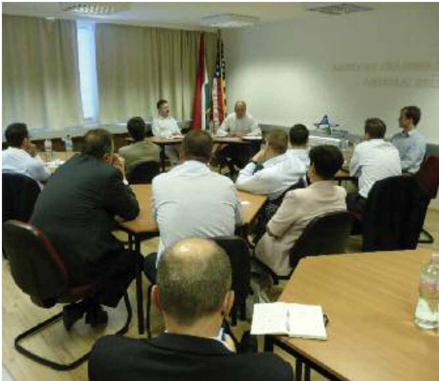
Open committee meeting

For the upcoming year the Committee plans to reorganize its working method and will organize more open meetings for tax experts and executives to maintain a dialogue, to channel and to exchange views on strategic and daily tax related issues.