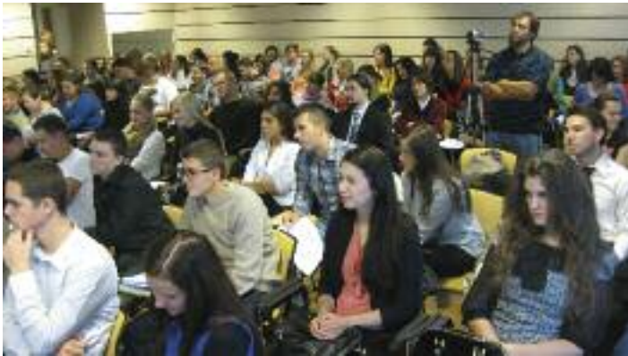
Board simulation at the University of Pécs