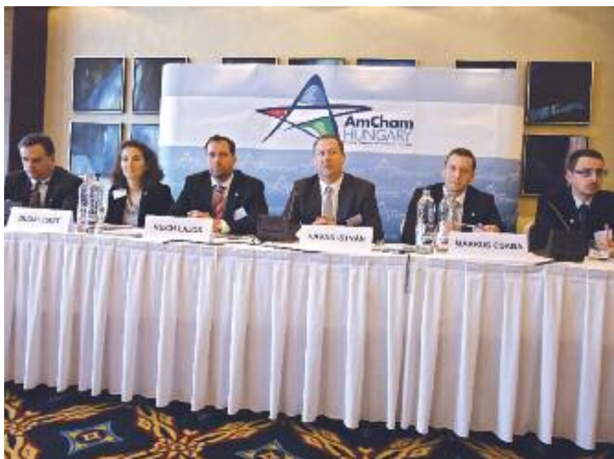
Press breakfast introducing the Innovation Position Brief

The Position Brief was made public in March of 2012 at a press conference, which was well attended by journalists and the main messages were reflected in the Hungarian press. We would like to thank GE Healthcare for sponsoring the event.