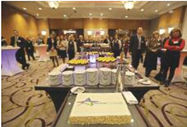
Business After Hours at the Intercontinental Budapest