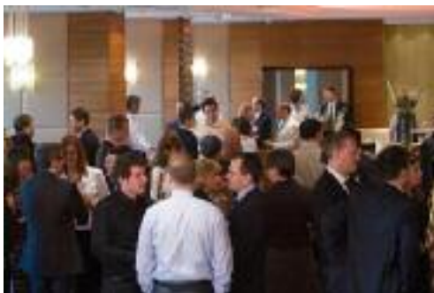
Business After Hours at ICON Restaurant