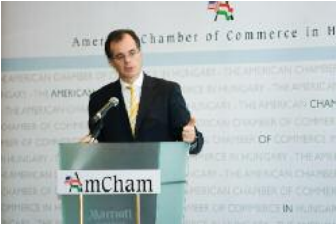
András Simor, Governor of the Magyar Nemzeti Bank