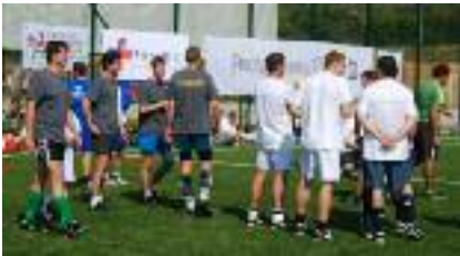
Preparing for the game