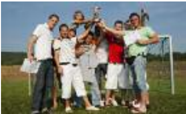
Interdean won the soccer tournament