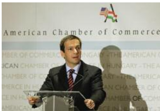
Prime Minister Gordon Bajnai