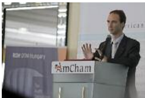
Minister Péter Oszkó