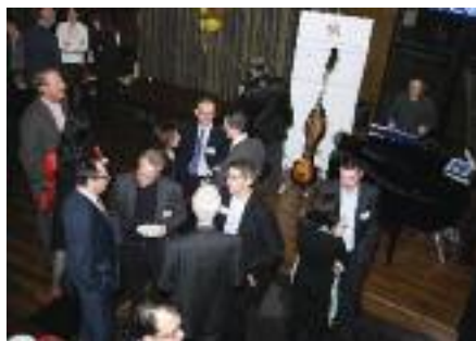
Business After Hours at Café Miro Grande