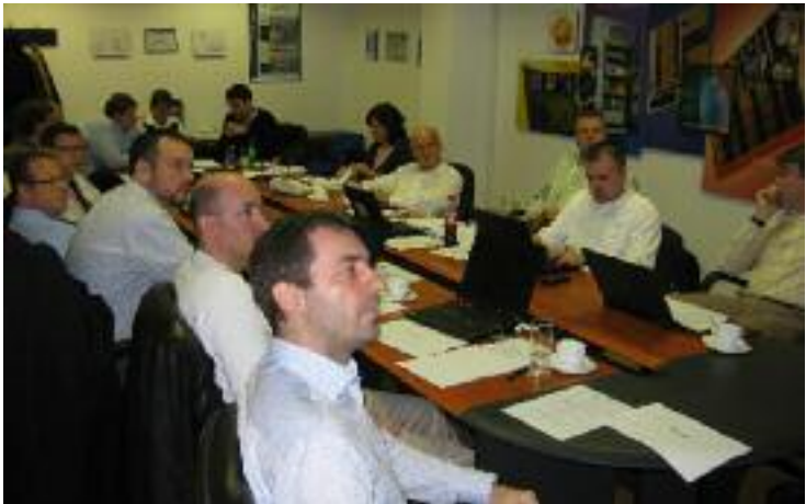
Electronic Manufacturers' Committee, Strategic Workshop