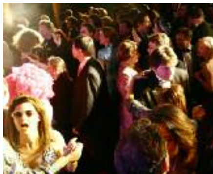
Dancing crowd at the AmCham-Pannon Valentine's Day Ball.