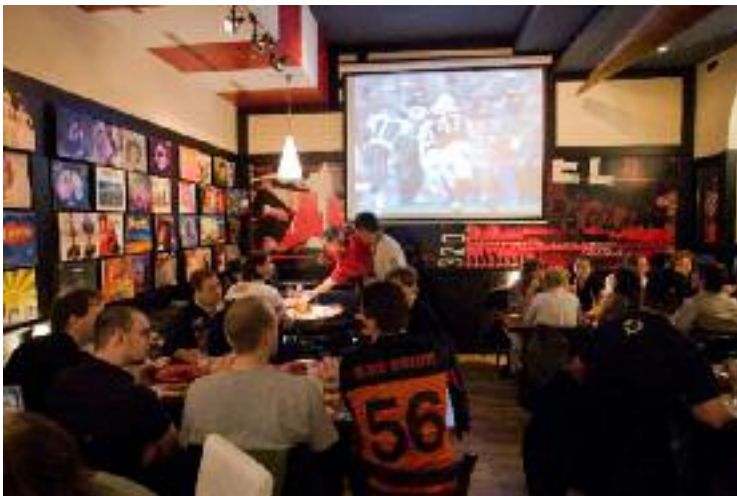
Super Bowl party at the T.G.I Friday's

Location: T.G.I. Friday's Oktogon Sponsored by: T.G.I. Friday's