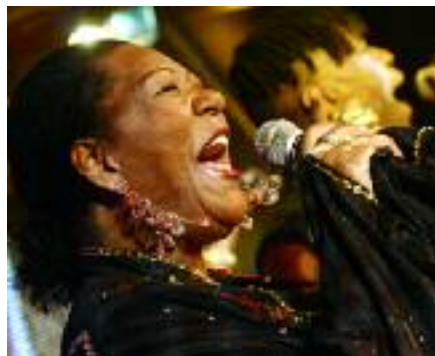
People enjoyed the exclusive and live show by Boney M. featuring Liz Mitchell.