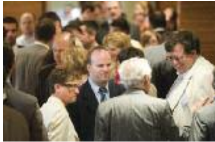
AmCham members enjoying the relaxed atmosphere at a Business After Hours at Hilton Budapest – ICON Restaurant

This year we organized a new series of social networking event, entitled AmCham Business After Hours that focused solely on building relations between fellow AmCham members and which also provided an opportunity for new members to introduce themselves to the other members. This year we had four Business After Hours and still one about to come in the beginning of December.