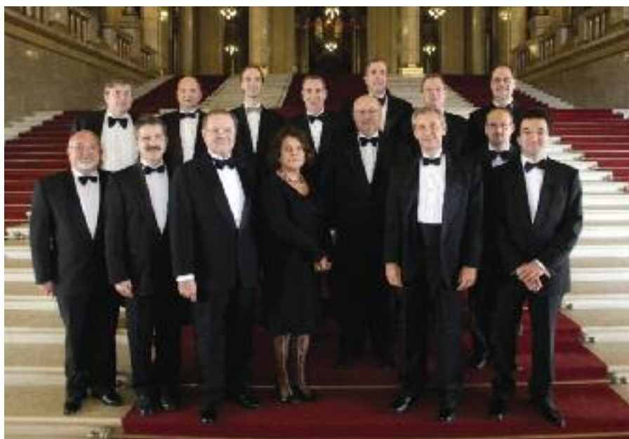
Former presidents, speakers, sponsors and AmCham staff members at the 20th anniversary reception in the Parliament.