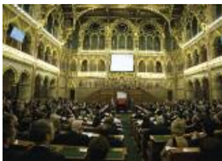
More than 350 people joined the event.

AmCham continued the cooperation with the CEU Business School , several training courses were held during the entire year.