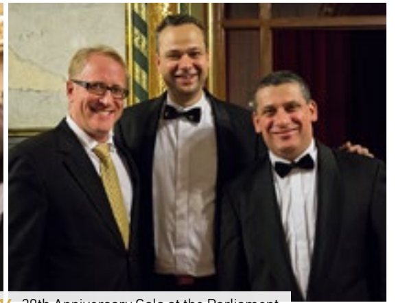
November 14: 30th Anniversary Gala at the Parliament.