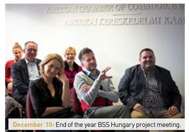
December 10: End of the year BSS Hungary project meeting.