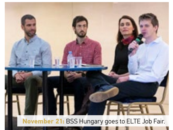
November 21: BSS Hungary goes to ELTE Job Fair.