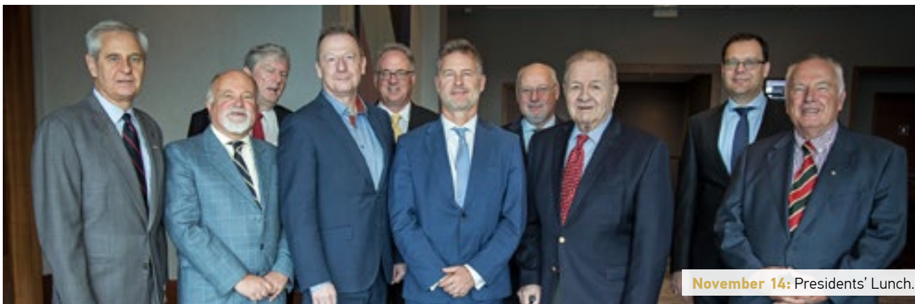
November 14: Presidents' Lunch.