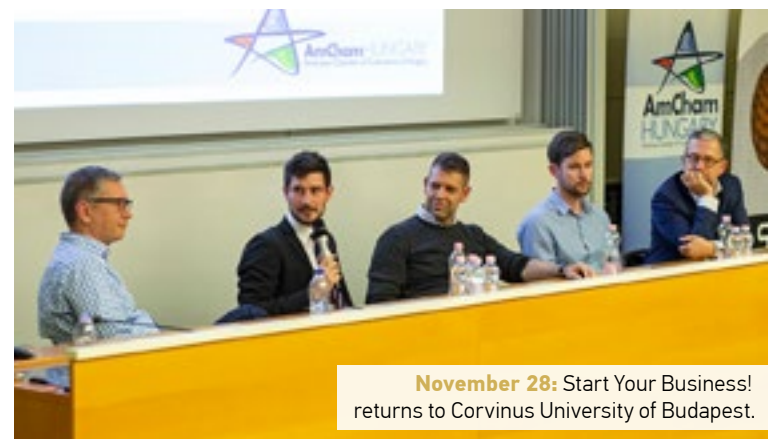
November 28: Start Your Business! returns to Corvinus University of Budapest.