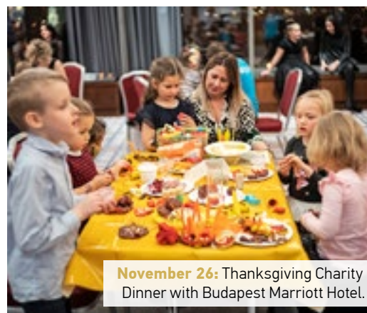
November 26: Thanksgiving Charity Dinner with Budapest Marriott Hotel.