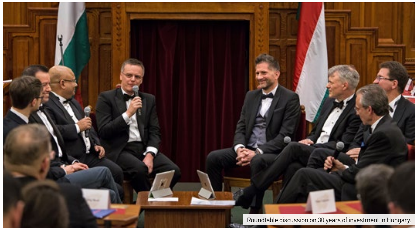
Roundtable discussion on 30 years of investment in Hungary.

"Thirty years ago I only had limited dreams. Now I know that our dreams can be as unlimited as our beliefs, efforts and dedication to make them come true. I can promise we will continue working hard to keep earning your trust and support, and I know we in AmCham have many successful years to come."