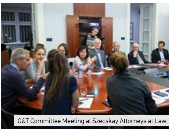
G&amp;T Committee Meeting at Szecskay Attorneys at Law.