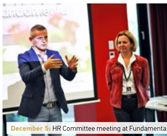
December 5: HR Committee meeting at Fundamenta.